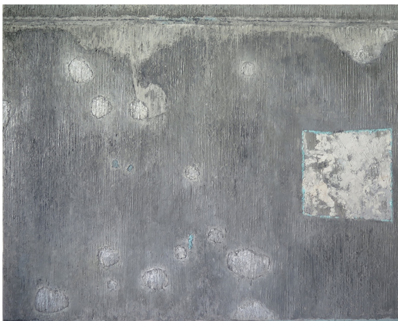
Chung Ka Chun Repair Oil, Cement, Plaster, Sand on canvas 150 x 120 cm, 2016