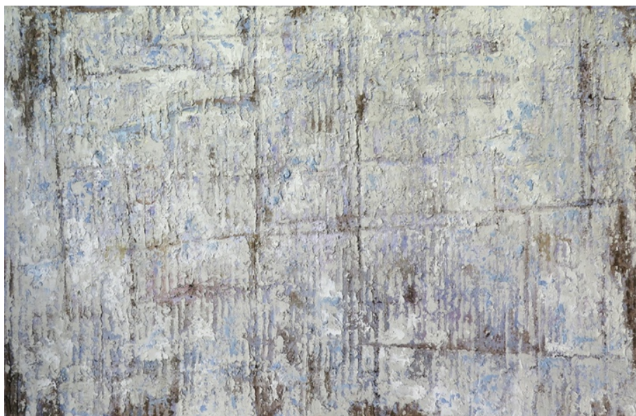
Chung Ka Chun Relax in the memory Oil, Cement, Plaster, Sand on canvas 100g x 65cm, 2016