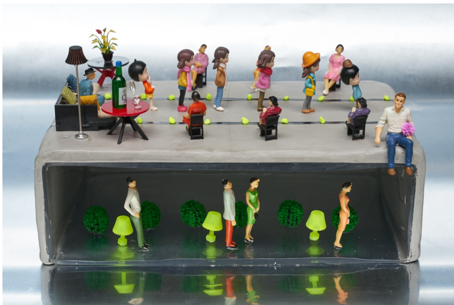
Sin Sin Man Ecstasy #2 Mixed Media on glass 29 x 18 x 8.5 cm, 2021