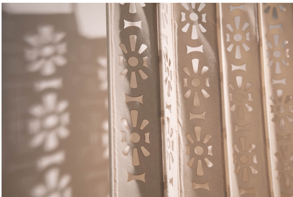
OUYANG Jiaqi Gate with Carved Patterns Cloth, acrylic tube, button, thread 222 x 214 x 28cm, 2021